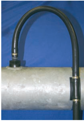
Special barbed clamp to support the drop hose.